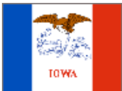
Iowa JCI Senate

November 27-29 Kansas City MO - KS Football Game and MO JCI Senate Holiday Party